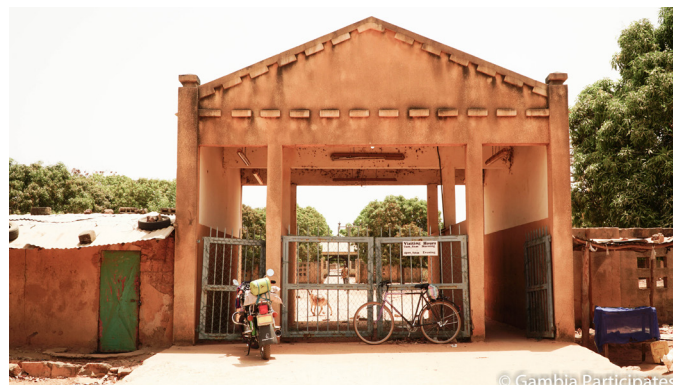
Soma District Hospital

Janneh Commission of Inquiry (tasked to investigate the financial dealings of Yaya Jammeh, former president of The Gambia). The Rapid Assessment Report identified "496 health workers and security staff who should be the focus of capacity strengthening in case management, surveillance, storage and warehouse management and infection Prevention and Control."